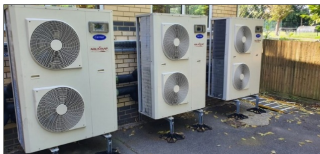
Caption: Air source heat pumps installed at Moss Hall Nursery as part of PSDS3a.

1.2.3 There is an outstanding issue at Foulds Primary, where the heat pump reports errors because of a point of failure between the boiler. The bivalent system design is intended to operate the gas boiler when the outside temperature drops to -2 degrees centigrade, so the boiler can provide the bulk of the heat for the school. Then, when there is sufficient heat in the buildings, the heat pumps should automatically switch on to maintain the temperature, and the gas boiler will shut down. The current issue is that the wiring connection between the boiler control panel and heat pumps is at fault. This was reported to the lead contractor in the week commencing 8 January, and a plan to resolve the faults is to be implemented as soon as possible.