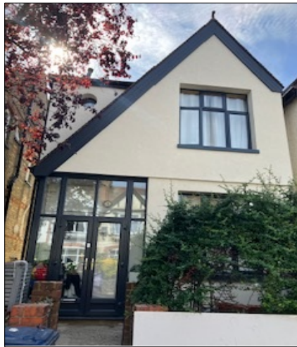
Caption: Front of the house with external wall insulation and

any others can be left with should be only be benefits in